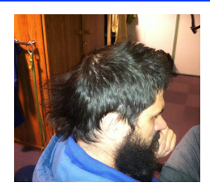
Fauxlet - pronounced "fo-let"

Quote - "Forming and keeping the shape of liberty spikes is beyond the capacity of most hair styling products, but a combination of glue, shaving cream, handstands, gelatine and egg whites work well"