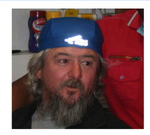
Il Pirata - aka 'The pirate'.

Quote - "I'm really too cool to wear a mullet, but I secretly like the style, so I'm going to wear a Fauxlet instead."