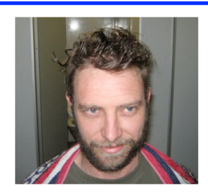
Fauxhawk - pronounced 'fohawk'

about our beards, hobbies and unique fashion choices. All these things are good ways of coping with the isolation and for expressing one's individuality without the fear of judgement by the outside world. Needless to say, this has resulted in several very distinctive hairstyles throughout the year, which we are going to reveal to you now, for your amusement and ours!